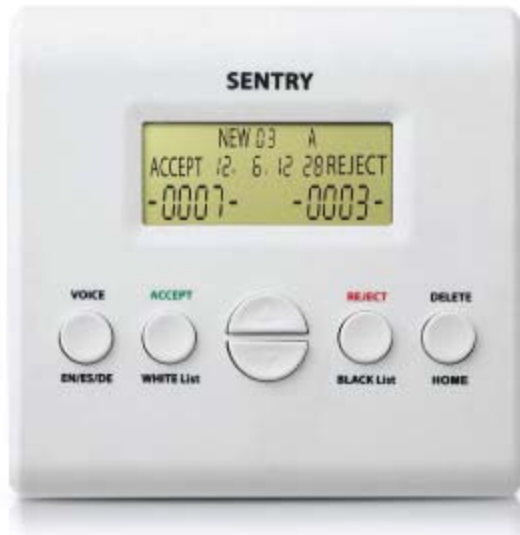
SENTRY 2 New and improved